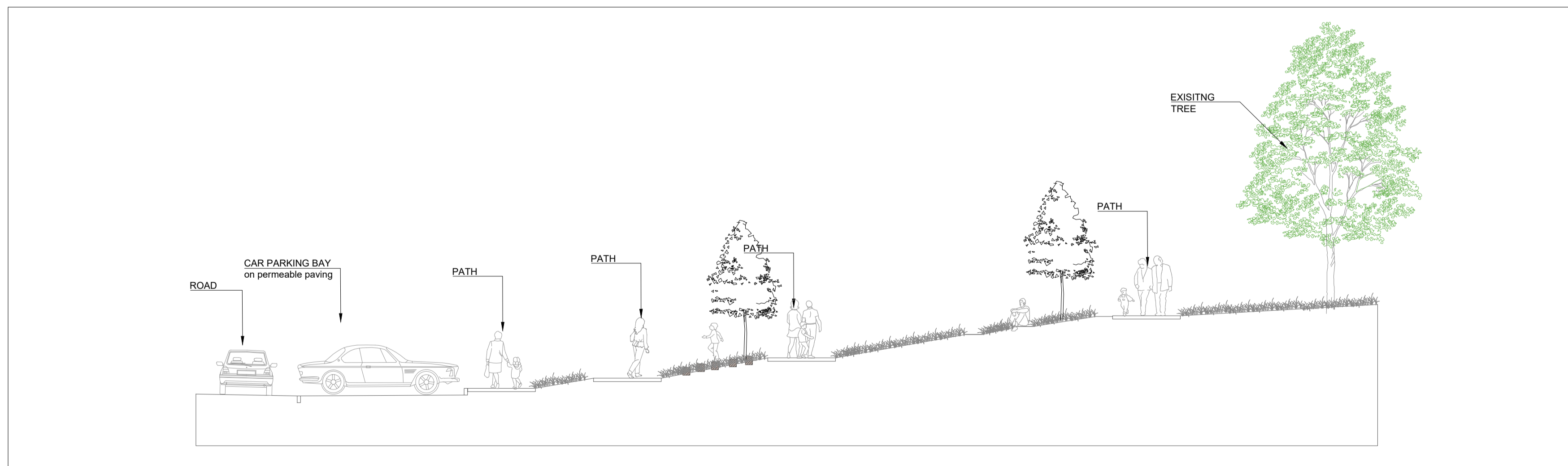
SECTION CC -Western park: Accessible path